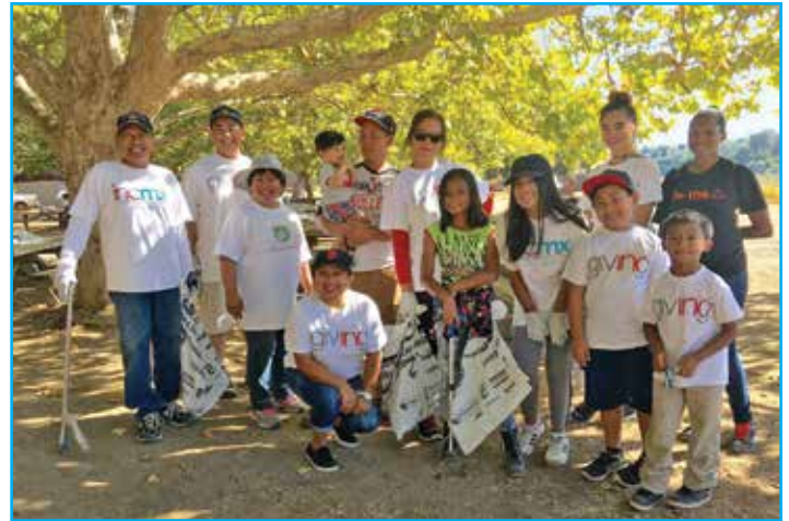
A few of the day's volunteers

We at FOLFAN send our heartfelt thanks to the 120 people who picked up trash on September 17th at Negro Bar and vicinity. We gathered over 500 pounds of trash, including three shopping carts! You made a difference as part of a worldwide effort to clean our waterways!