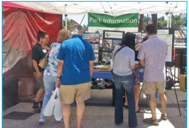
Free park maps and information for everyone interested in Folsom Lake State Recreation Area.

Several times during 2016, FOLFAN board members joined the 40-plus vendors at the Folsom Historic District Farmers Market that is held every Saturday. FOLFAN's photo-filled exhibit provides visitors with park information, including maps and brochures, and a sign-up for FOLFAN's e-mailing list to receive information about park events and activities. The outreach also results in new FOLFAN members, but best of all, it gives FOLFAN board members a chance to talk about our park with local and regional residents and visitors!