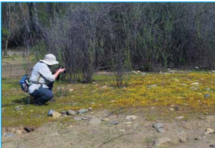
Mississippi Bar wildflowers

Along the way, wildflowers, deer and many birds are likely to be seen. Various species of ducks and other water birds can be seen in the pond, along with non-native turtles often sunning themselves on logs and rocks.