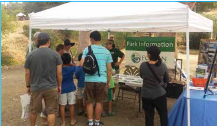
The FOLFAN booth is always a favorite for kids (and their parents) with our hands-on watershed demonstration!

New for 2016, was a parade on the park grounds to commemorate the fifth year of this event.