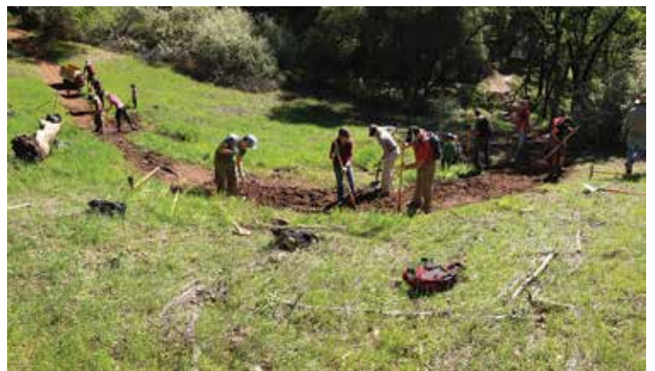
Volunteer trail repair crew.

We will keep our members and fans informed (via our monthly newsletter) as our Trails Program evolves. And we will ask for volunteers to come out and help with the trail work when the opportunities arise.