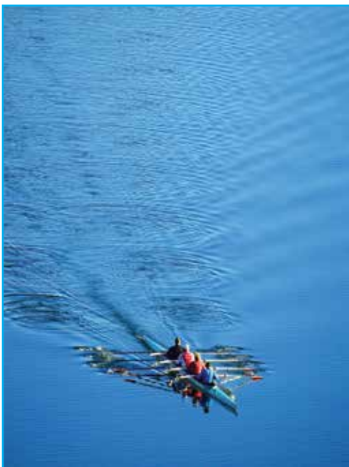
Another 2016 photo contest entry.